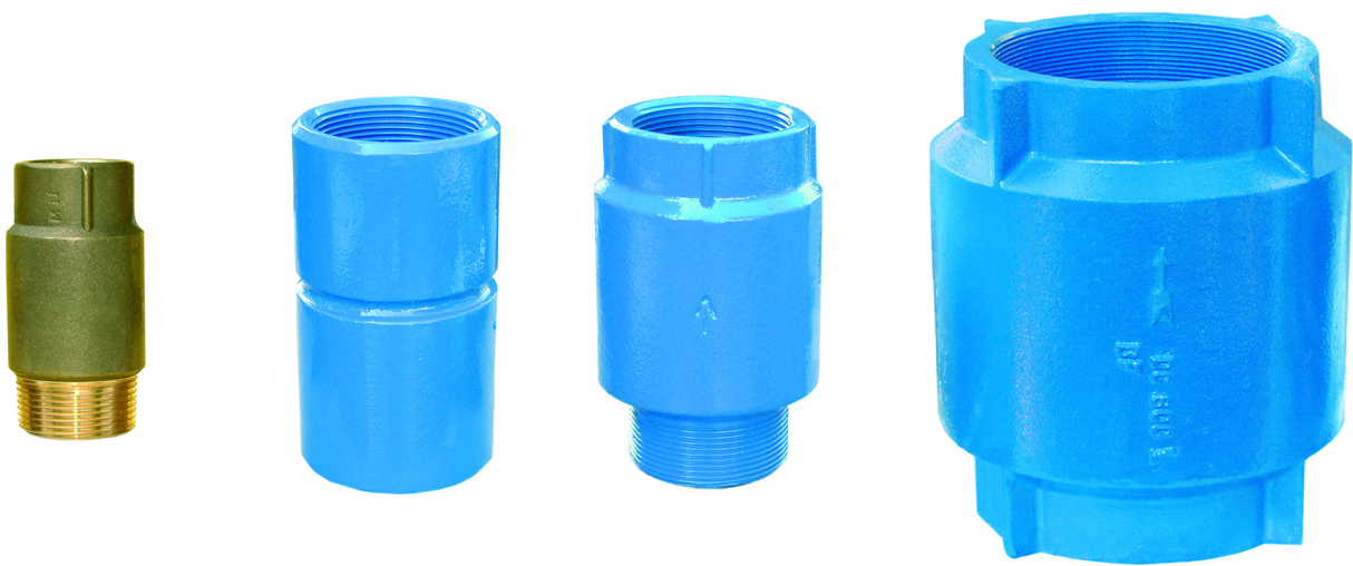
Typical Simmons Check Valves. (Specifications on pages 4 through 9.)